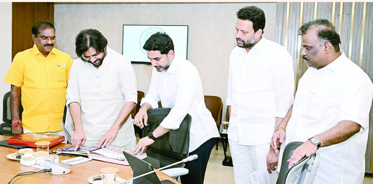
Minister for HRD Nara Lokesh presenting Yuvagalam tablebook to Deputy Chief Minister Pawan Kalyan at Secretariat on Wednesday