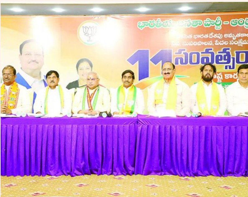
Union Minister Bhupathi Raju Srinivas Varma and several BJP leaders celebrating the 11 year rule of Prime Minister Narendra Modi at party state office in Vijayawada on Wednesday