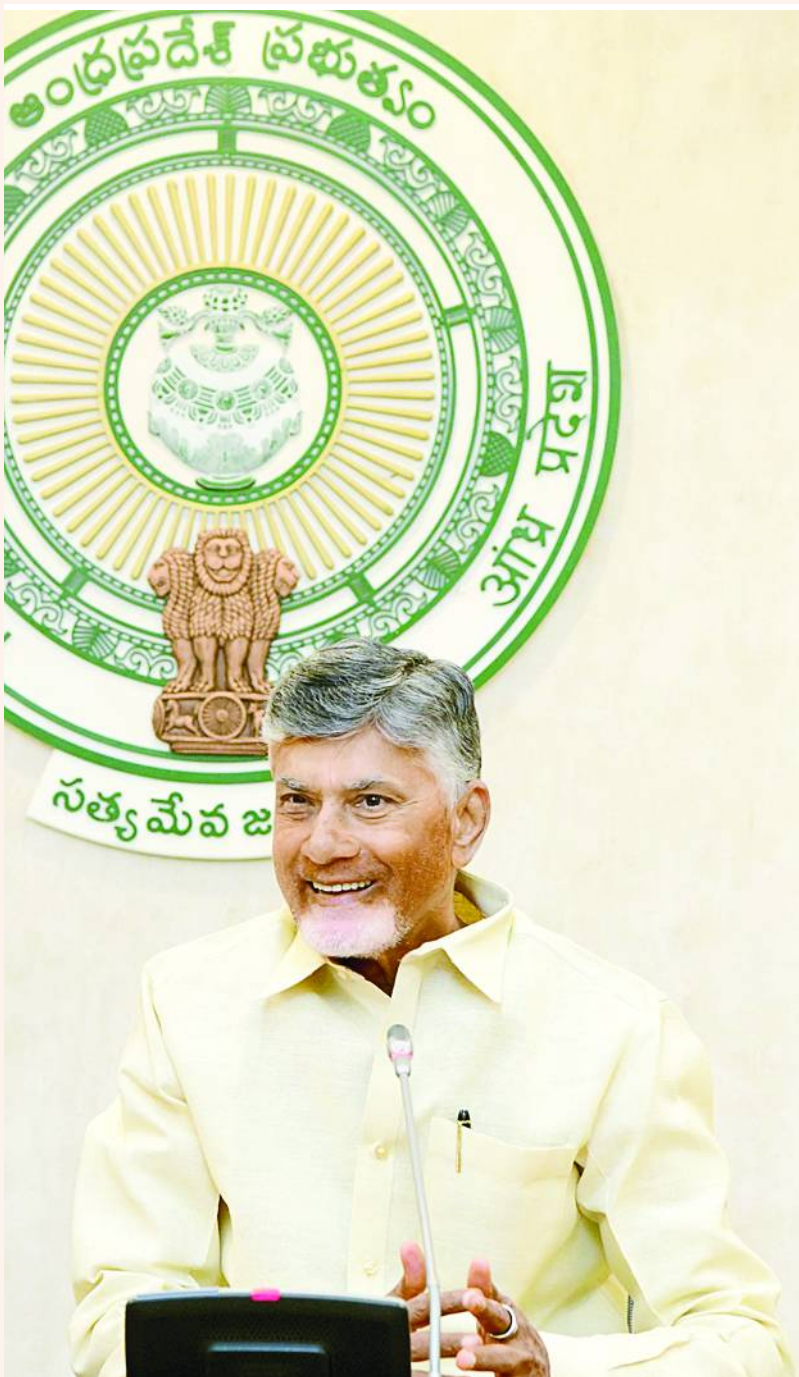
Chief Minister N Chandrababu Naidu and other council of ministers discussing in cabinet meeting at AP Secretariat on Wednesday