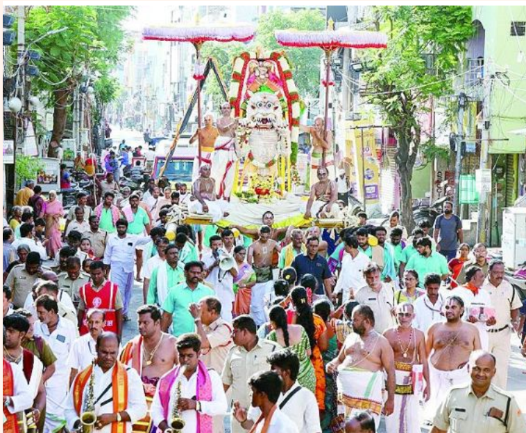
Simhavahana Seva as part of annual Brahmotsavalu at Govindaraja swamy temple in Tirumala on Wednesday