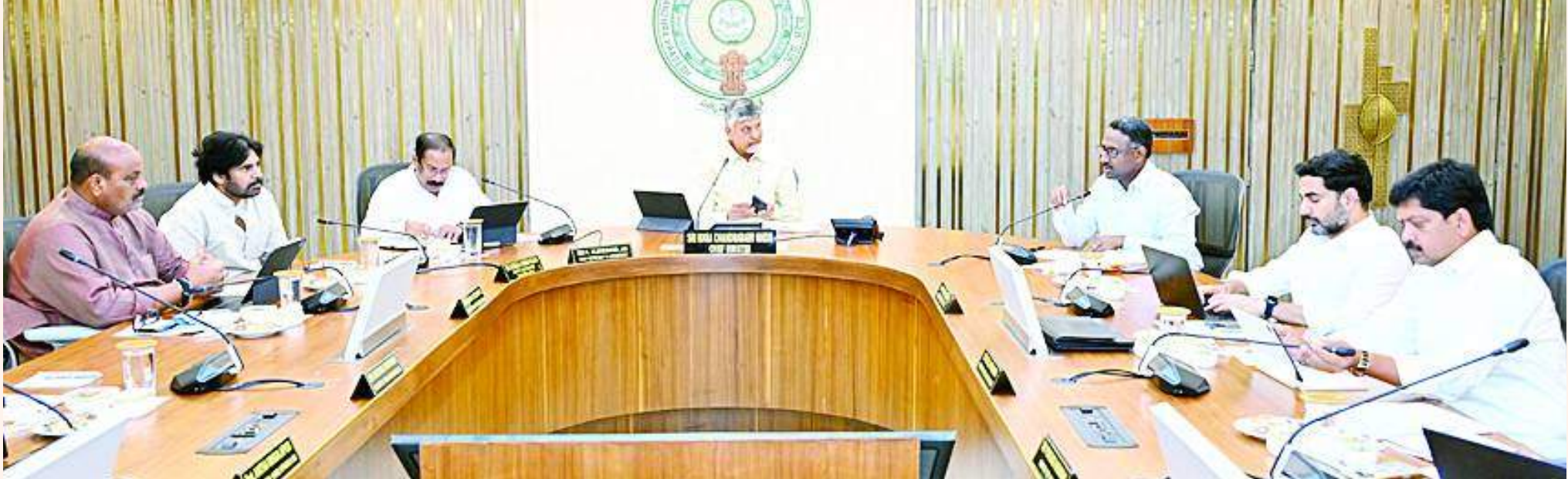
Chief Minister N Chandrababu Naidu and other council of ministers participating in AP cabinet meeting at AP secretariat on Tuesday