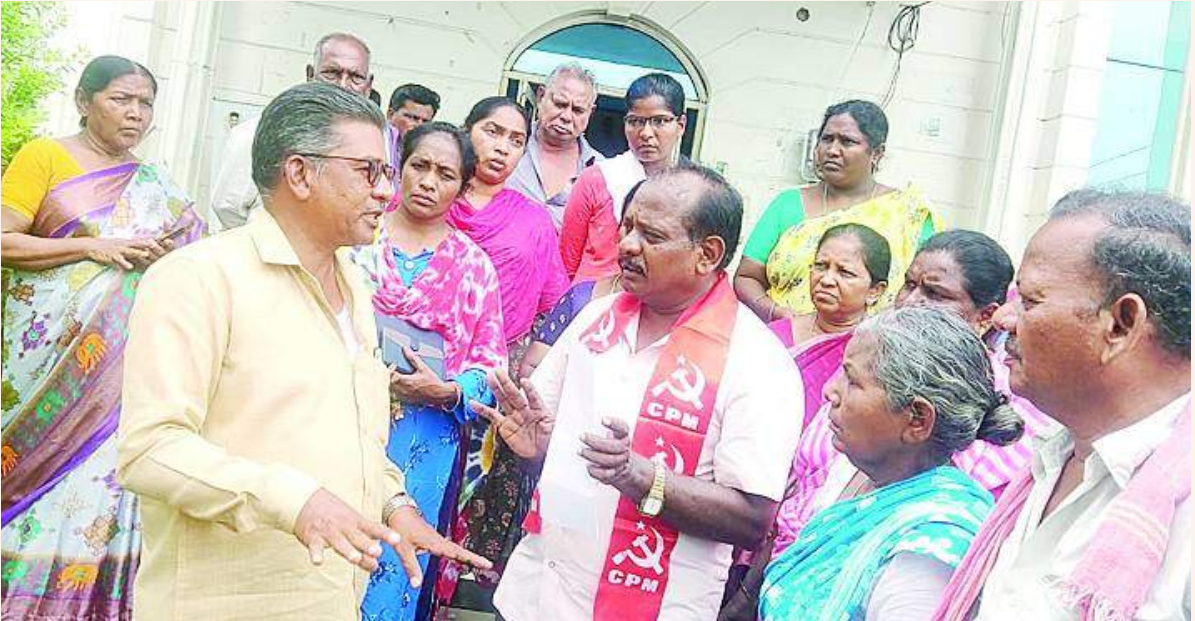
The leaders of CPM staging protest at Mandadam panchayat office on Tuesday demanding the government to provide drinking water