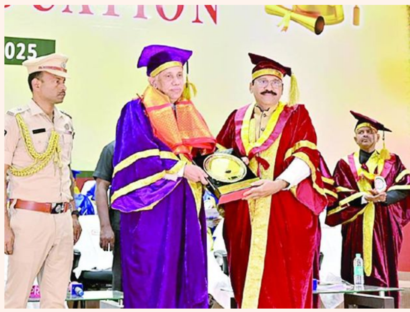
AP Governor Abdul Nazeer participating in JNTU convocation and presenting degrees to students at the venue in Anantapur on Saturday along with the university officials