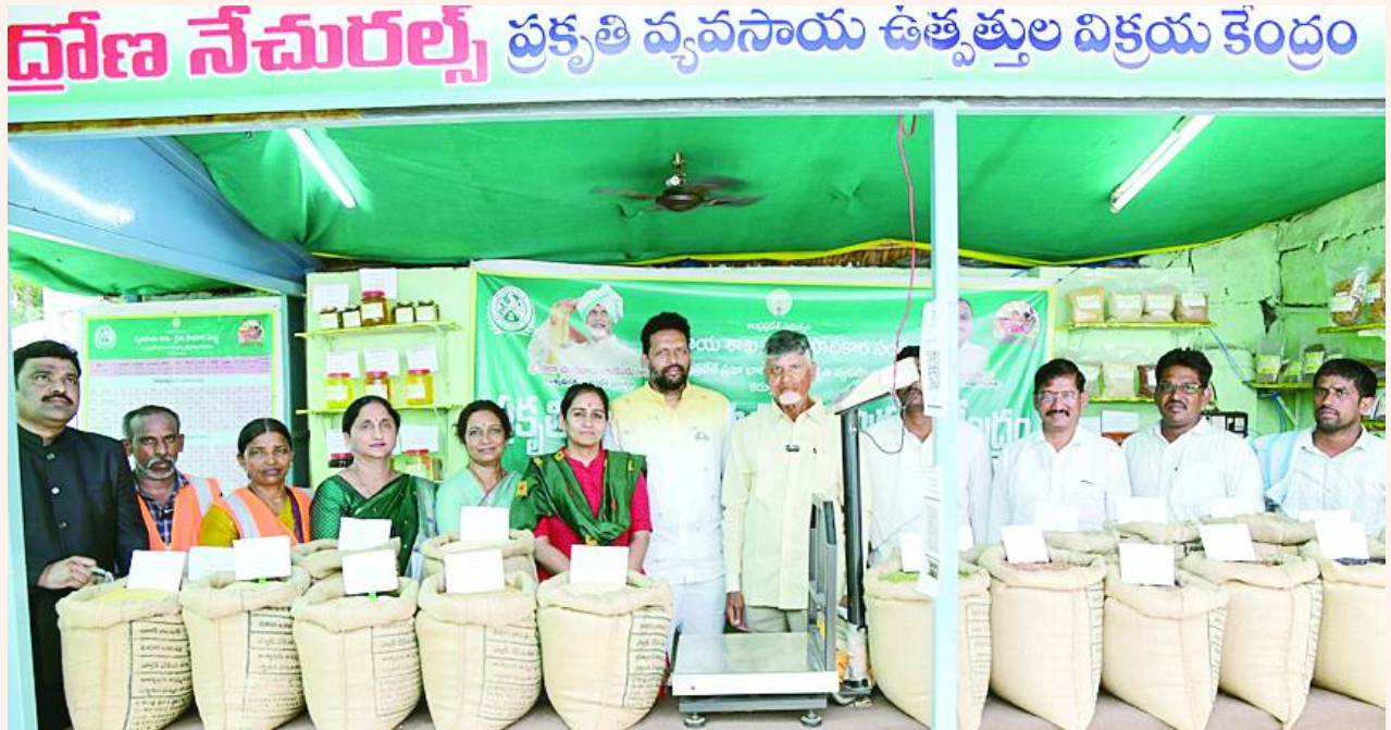
Chief Minister N Chandrababu Naidu participating in Swarnandhra-Swachhandhra programme at Panyam constituency in Kurnool district on Saturday and also inspecting C-Camp Rythu Bazar along with officials