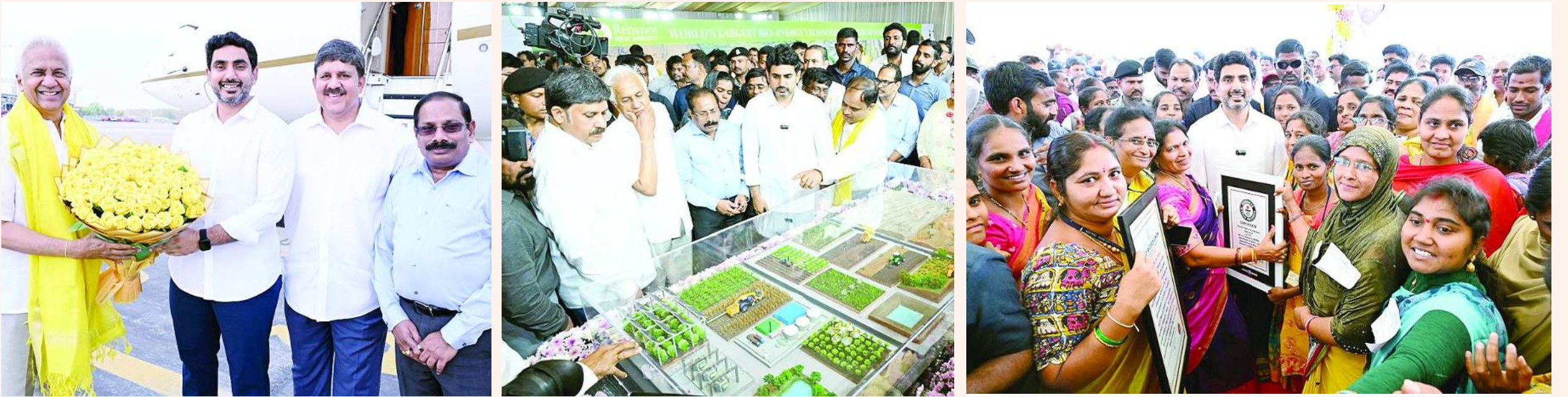
Minister for IT Nara Lokesh participating in the inauguration of CBG plant at Kanigiri in Prakasam district on Wednesday along with Reliance Group PMS Prasad and other officials