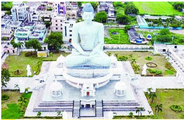
2 CM Naidu pushes for fast-track completion of Amaravati Bypass

Printed at VIJAYAWADA • HYDERABAD • DELHI