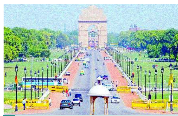
3 Swati Maliwal raises concern over unchecked growth of e-rickshaws in Delhi