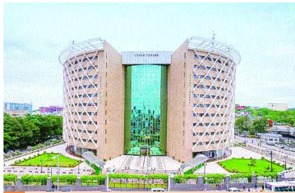
2 SC on Telangana CM statement over bye-elections