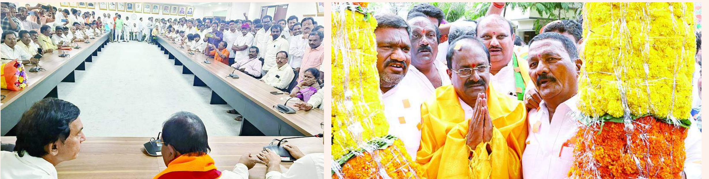
Newly elected MLC Somu Veerraju being felicitated at party office on Wednesday