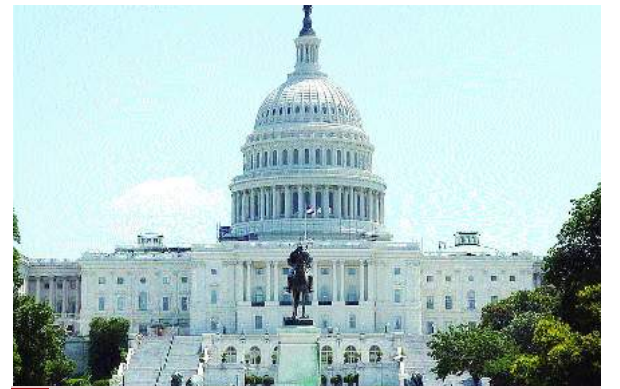
5 Senate confirms Matt Whitaker as Trump's ambassador to NATO