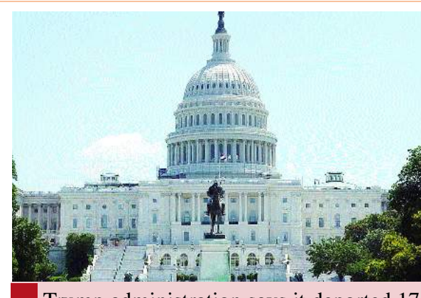
Trump administration says it deported 17 more violent criminals' to El Salvador