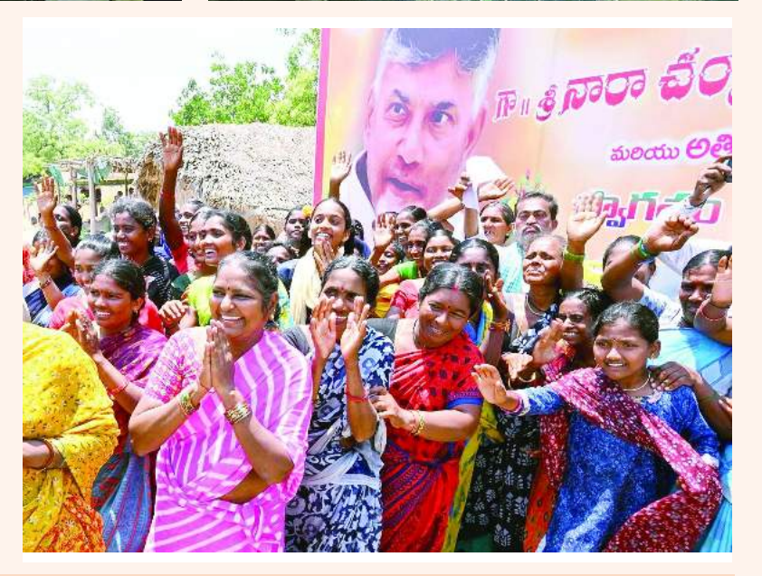
Chief Minister N Chandrababu Naidu participating in NTR Bharosa pension distribution programme at Kottagollapakem village in Bapatla district on Tuesday