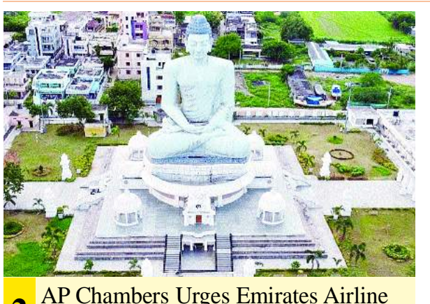
AP Chambers Urges Emirates Airline for Direct Vijayawada-Dubai Flight

Printed at VIJAYAWADA • HYDERABAD • DELHI