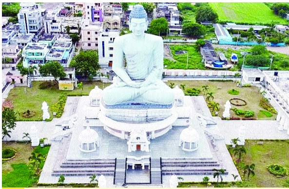
2 Road accident claims lives of three, including two doctors

Printed at VIJAYAWADA • HYDERABAD • DELHI