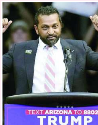
TEXT ARIZONA TO 8802 TRUMP

Washington, Dec 1 (The Capital News): President-elect Donald Trump's stunning announcement on Saturday night that he will nominate Kash Patel as FBI director sets the stage for a fresh round of turbulence at a law enforcement agency tasked with protecting the homeland and investigating federal crimes. Patel, a steadfast Trump ally with plans to shake up the institution he's been tapped to lead, is a study in contrasts from the current tight-lipped director who preaches a "keep calm and (Cont.on P4)