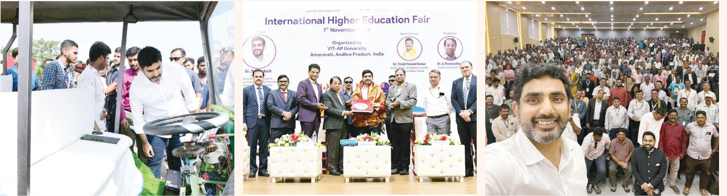
Minister for HRD & IT Nara Lokesh inaugurating international higher education fair at VIT in Amaravati on Thursday. Lokesh taking part with interaction session with students