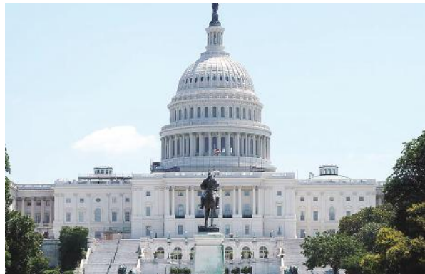
5 Joe Biden gets blamed by Harris allies for vice president's resounding loss