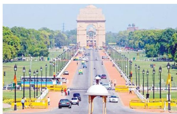
3 Lancet study linking deaths to air pollution not absolute: Pollution control board tells NGT