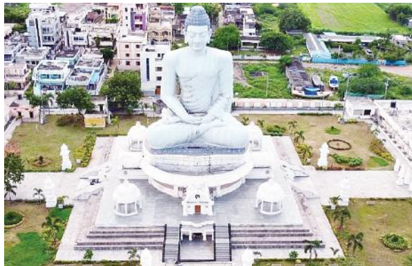
2 BJP cemented Goa's political stability under CM Sawant: Party leaders

Vol-1. Issue-242. THURSDAY 7 NOVEMBER 2024 Printed at VIJAYAWADA • HYDERABAD • DELHI