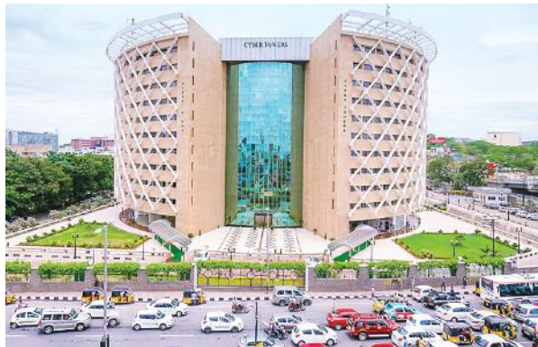
2 SC refuses to transfer Kolkata rape-murder case trial outside West Bengal