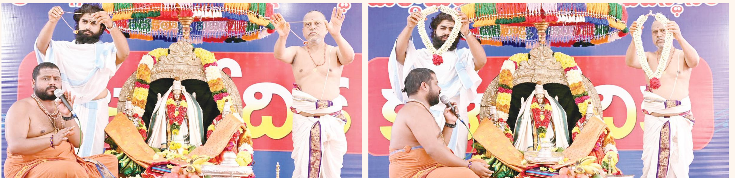
The priests performing Sri Valli Sahita Subramanya swami kalyanam at Durga temple on Thursday